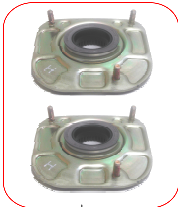
VKDC 45610 T

The NEW VKDC 35634 T is provided with 2 filtering blocks ensure the customer can do a complete repair kit. The propose of these rubber spring seats is to filter all vibrations transmitted by the suspension spring but also by the suspension strut.