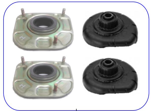
NEW VKDC 35634